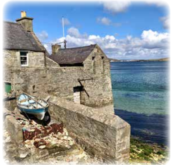
If you've watched the BBC Shetland detective series, you'll recognize this house.