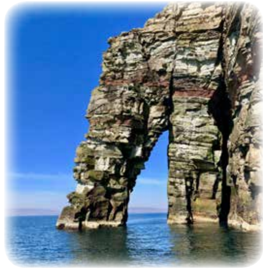
We motored through this gorgeous cliffside opening on Bressay Island.