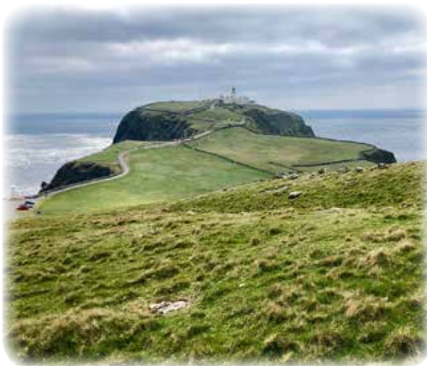
Sumburgh Head and Lighthouse reach south into the North Sea, a beautiful setting.