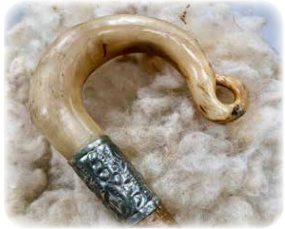
You'll learn how a shepherd's crook is made.