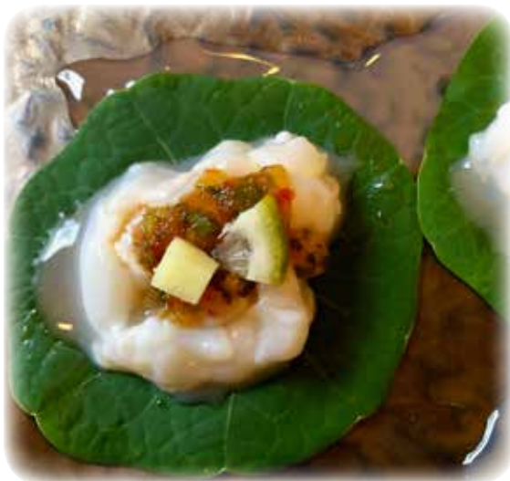
North Sea scallop ceviche served on a fresh nasturtium leaf...so much good food!