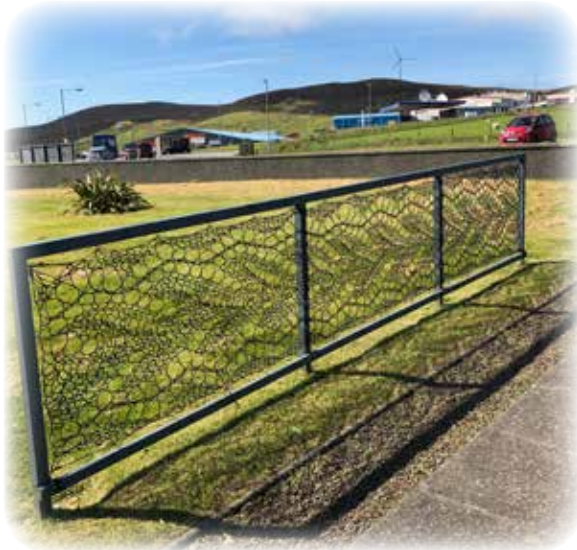
This is the famous knitted fence. We'll tell you how to find it!

Saturday, May 2 is our final morning in Shetland. After breakfast we'll check out, store our luggage, and head to the splendid Shetland Museum & Archives for a relaxed exploration of their beautiful collections. They have a nice cafe upstairs with a beautiful view, or you may want to enjoy lunch at one of your favorite restaurants and do a little more shopping before we board the Northlink Ferry mid-afternoon for our return trip back to Aberdeen. Once again, we'll have staterooms and have dinner and breakfast aboard, arriving in Aberdeen at about 7:00 Sunday morning. We'll check back into our Aberdeen home at the Carmelite Hotel, and you're free to explore until about noon when we gather for a farewell lunch together. What a journey it's been!