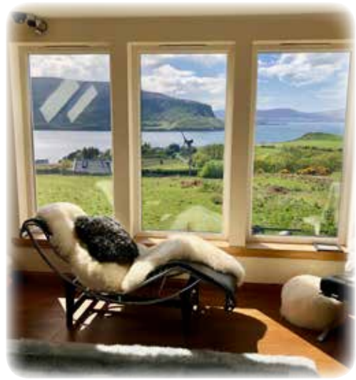
In the Skye Skins showroom you will be tempted to have a bit of a nap!