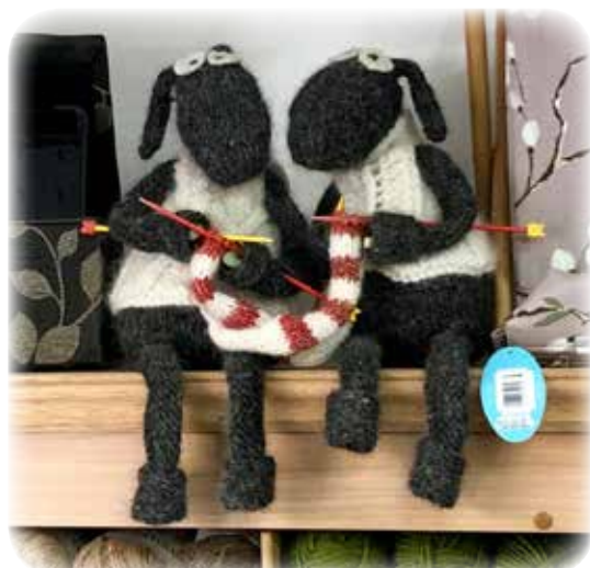
In the wool shop.