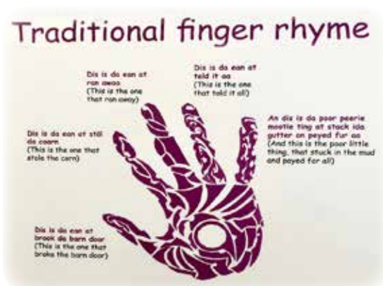
This children's sing-song rhyme gives you a glimpse of Scottish English.