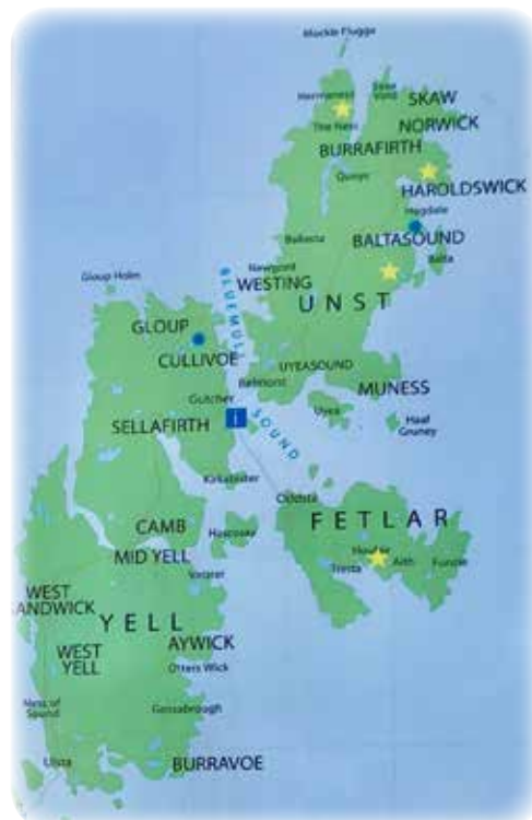
The northern isles of Yell and Unst.

Our home base in Lerwick is on the largest of the Shetland Islands. We've chosen the Queens Hotel for its history, quaint character, and stunning location in the ancient Lodberries, built right into the water. It will be a unique experience to stay there. One day we'll drive to the very northernmost point of the Shetland Islands, taking one tiny ferry to the Isle of Yell and then an even tinier ferry, charmingly named Bigga, to the Isle of Unst, to visit the Unst Heritage Center, a community of local cobweb lace knitters and other crafters, and browse the museum collection of textiles and historic artifacts. We'll also drive as close to the Muckle Flugga Lighthouse rock as possible to catch a glimpse from the high cliffs. It is the northernmost point in all of the UK. Finally, back on the main island, we'll stop for supper at Frankie's Fish 'n Chips, the UK's most northerly fish 'n chips shack.