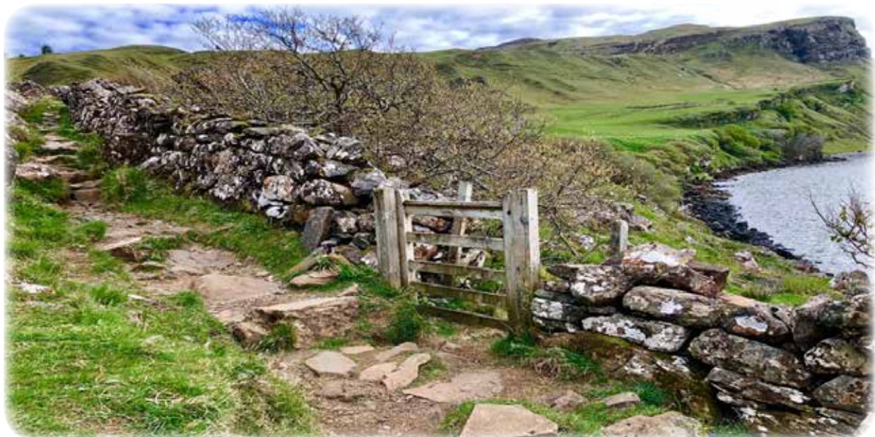
If you love to hike, there is a spectacular wilderness adjacent to our beautiful hotel!