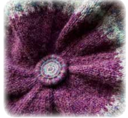
A button tops a Scottish tam.