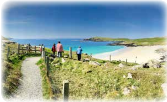
The short trail down to Meal Beach. Look at that cerulean blue and pure white sand.

Another day we'll drive west to Scalloway to visit the museum and castle. We'll continue on to the white sand and Carribbean-blue waters of Meal Beach, where we may even have a meal (a picnic) if the weather is suitable. Then onward to the idyllic Burra Isles (via several little bridges) to visit our friend Wendy Inkster of Burra Bears, to learn how she transforms old Fair isle sweaters into endearing, internationally sought-after bears. And one evening we hope to gather with members of the Shetland Guild of Spinners, Weavers, Dyers and Knitters too!