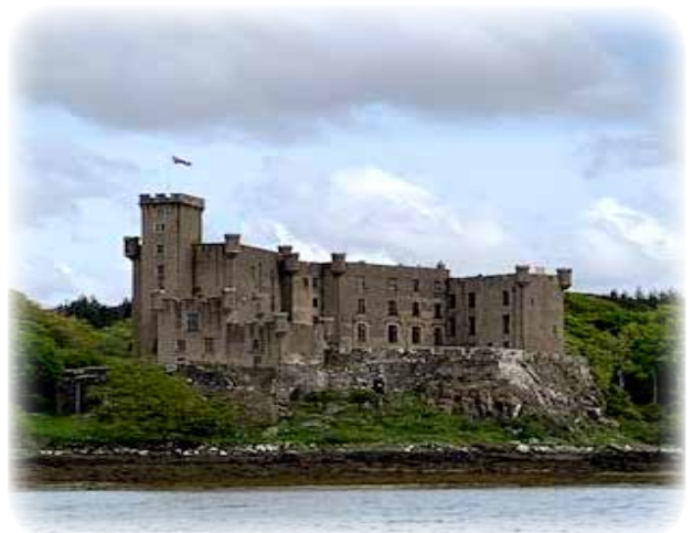
Dunvegan Castle and formal gardens.