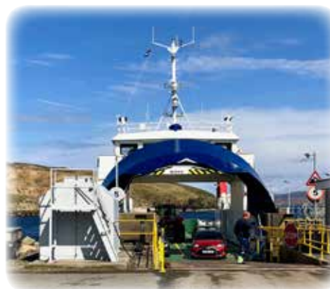
The wee Bigga will carry us between the isles of Yell and Unst.