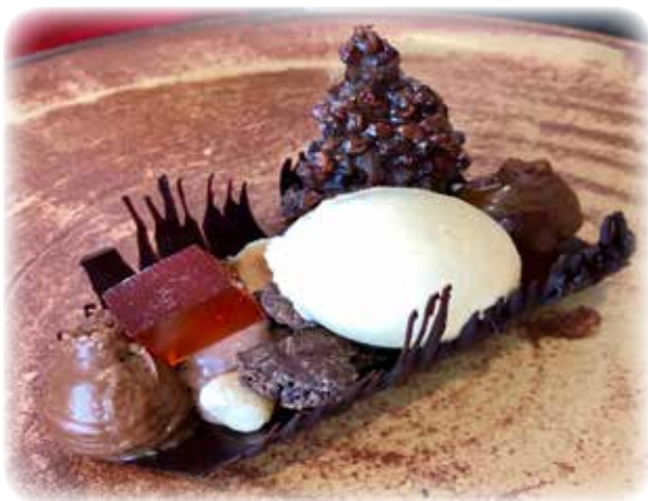
A dessert choice during our long, leisurely multi-course lunch at Three Chimneys.