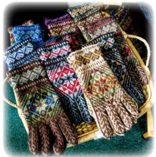
You can buy these handknit gloves at Wilma's studio, or knit them yourself!