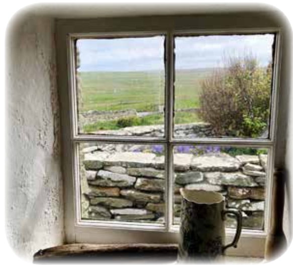
A tranquil croft window.