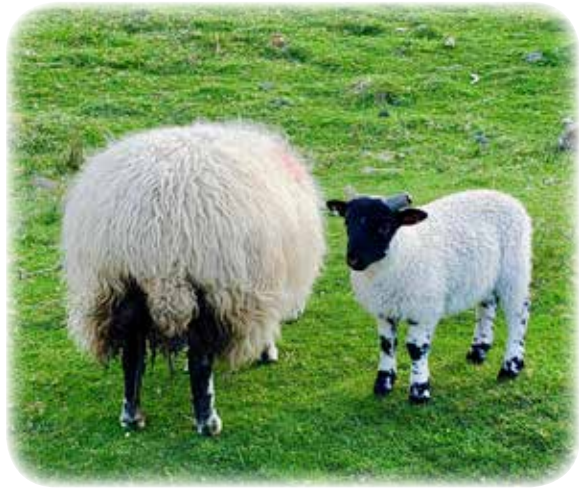
Mama and baby