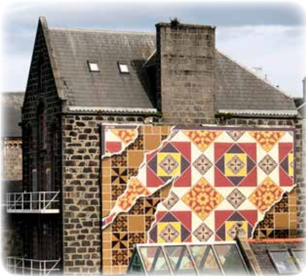
Aberdeen street art.