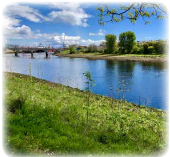
Perhaps you'll use some of your final day strolling along the banks of the River Dee.