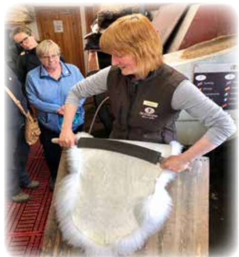
We'll learn how the sheepskins are tanned and made beautifully fluffy.