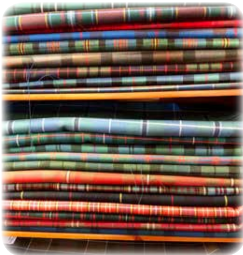
Tartan yardage ready for kilts.

Sunday, we'll gather together after breakfast (always included), and Cat will introduce the knitting project. During the days ahead, anytime we are on the road, Cat will welcome you to come sit beside her for a consultation if you need one. This evening, we'll enjoy dinner together at the Carmelite (included). Aberdeen is a wonderful blend of grand old stone architecture and winsome neighborhoods with pathways that make you feel you are out in the country. We especially love the street art, the River Dee, and the Footdee/Fittie neighborhood at the foot of the Dee. While walking about the harbor or along the beach, you may even have the good fortune to spy dolphins. Here is a wonderful article about Aberdeen: HTTPS://WWW.NYTIMES.COM/2019/06/18/TRAVEL/52-PLACES-TO-GO-ABERDEEN-SCOTLAND.HTML?ACTION=CLICK&MODULE=FEATURES&PGTYPE=HOMEPAGE