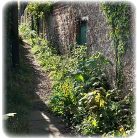
A leafy path.