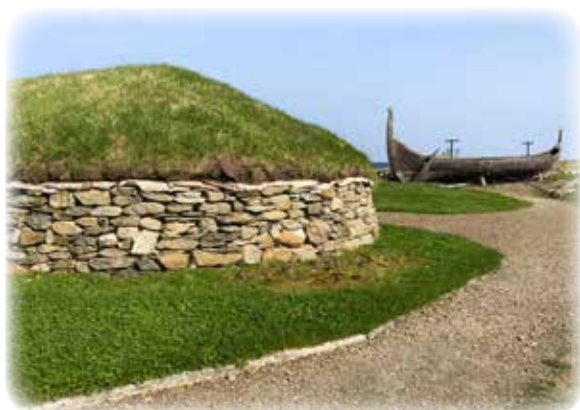
We'll pause on Unst to explore this traditional sod building and Viking boat.