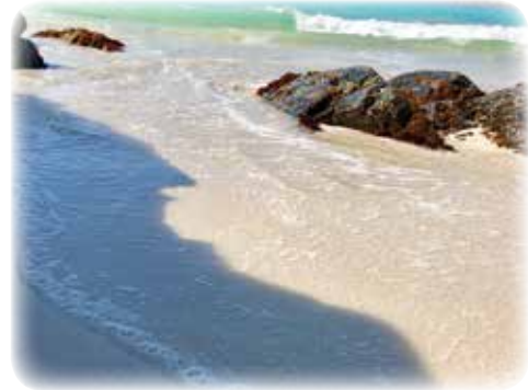
Meal Beach is pure bliss.