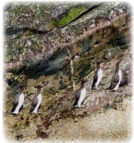
The Common Guillemot resembles a tiny penguin in so many ways.