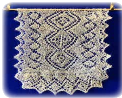
At the Heritage Center you can buy this pattern and the cobweb yarn.