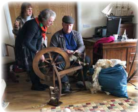
Learning to spin.