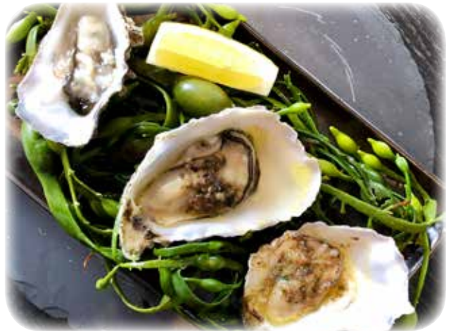
The Three Chimneys offers unique oyster presentations, all mouth-watering.