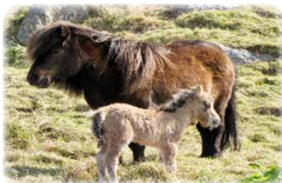
We usually find Shetland ponies on Unst or Yell. Yes, we'll stop so you can pet them!