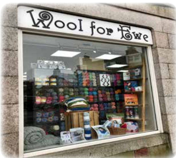
The friendly Aberdeen wool shop.