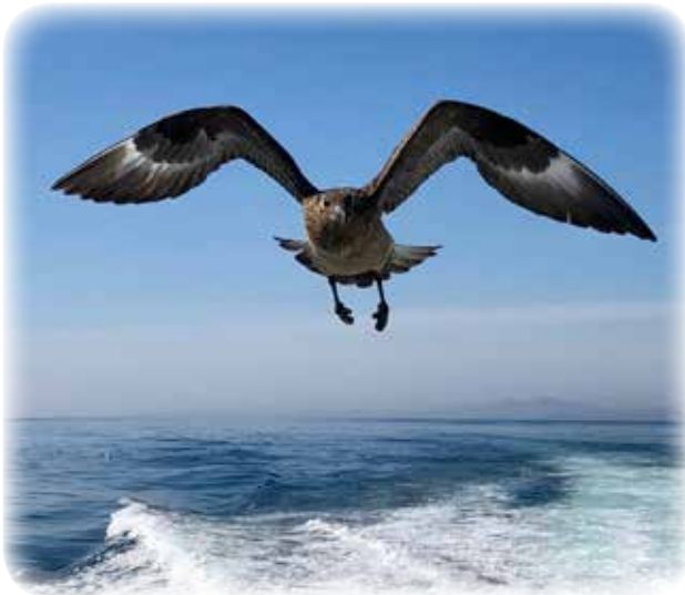
This powerful Great Skua flew behind our boat for a while. They are very impressive birds.