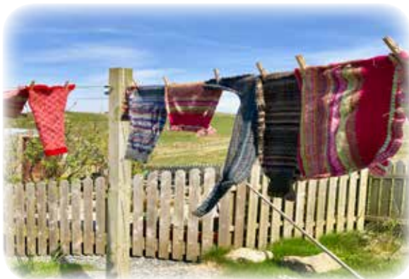
Wendy lightly felts old sweaters for her bears— here are some drying on her line.