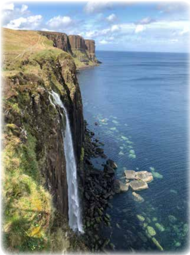
We'll drive to northern Skye to marvel at this spectacular waterfall and other natural wonders.