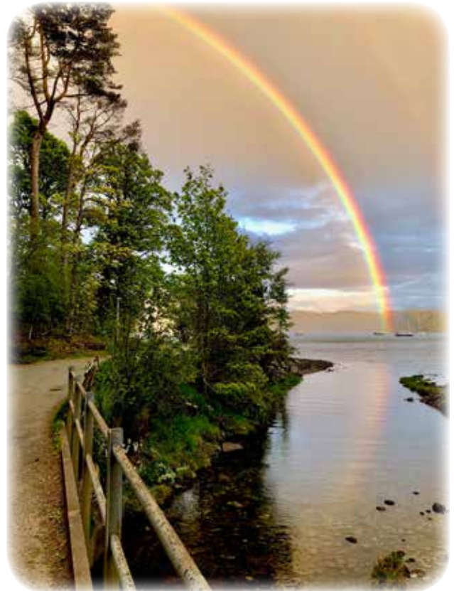
In 2019 this enormous rainbow filled sky, sea, and stream beside the path to our hotel.