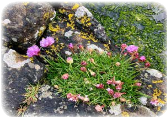
Where Dunvegan land meets the sea.