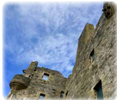
The Scalloway castle is wide open for wandering and wondering.