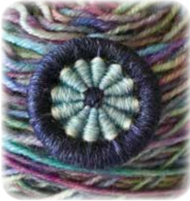
One of our travelers made this last year—her first try!