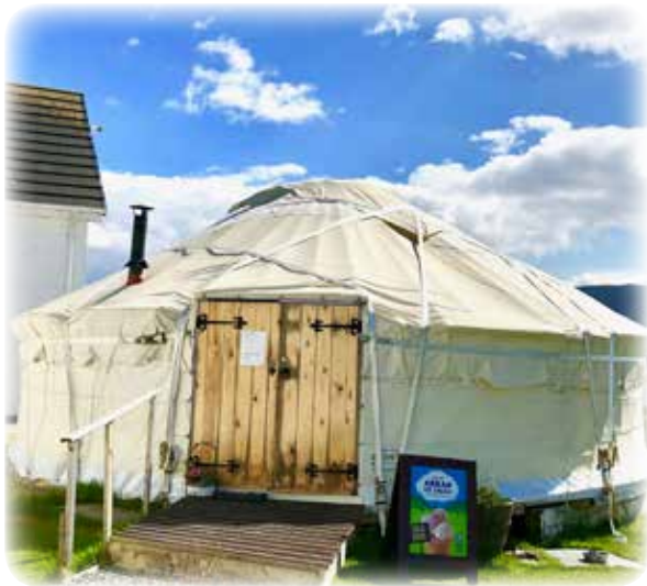
We love the friendly, cozy, happy atmosphere and good coffee in the YurTea yurt.

If you are a whiskey aficionado, you'll savor today's adventure. After breakfast we'll drive west across the island to the famous Talisker Distillery for an in-depth tour that includes tastings and the heady experience of breathing the whiskey-filled air as you see the process up close. Afterwards we'll drive a mile up the hill to the Oyster Shed for lunch. Save room for dessert though, because our next stop will be Skye Skins and the adjacent YurTea, a charming yurt coffee shop with delicious pastries. Skye Skins is one of the only remaining traditional tanneries, and they have dozens of breeds of sheepskins lining the sides of a long light-filled loft. If you want to buy one, they will ship it for you, and good luck choosing which variety you like best: curly, gray, cream, black, long and silky, on and on it goes.