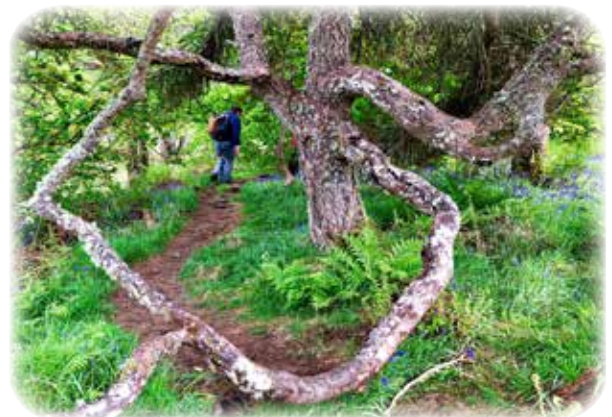
Just beyond Dunvegan Castle's formal gardens, a magical tree beckons the imagination.