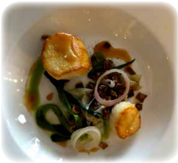
Local scallops in our hotel.