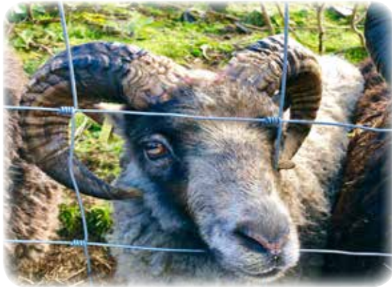
A North Ronaldsay ewe, fond of seaweed.