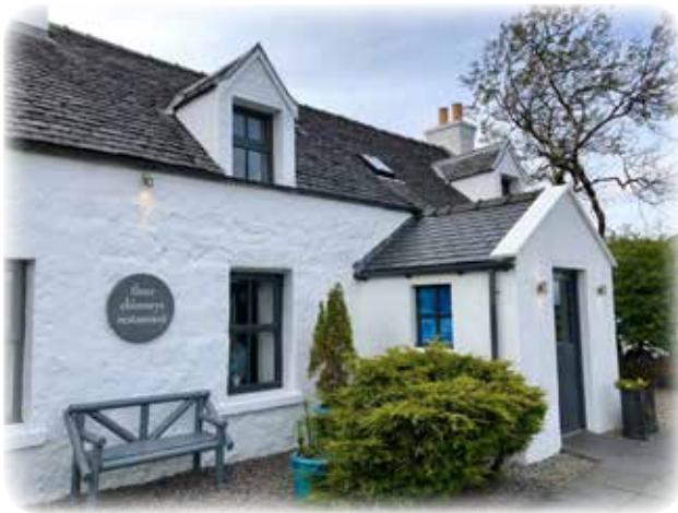
The Three Chimneys Restaurant draws gourmands from all over Europe, and us!

We'll devote one day on Skye to savoring lunch at the internationally revered The Three Chimneys Restaurant. Afterwards, we'll explore the intricacies of Dunvegan Castle and its formal gardens.