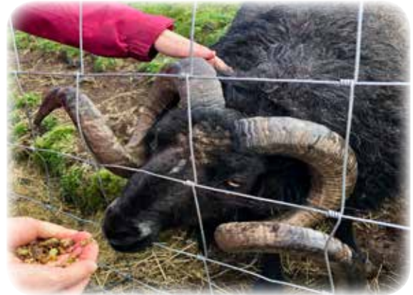
A Hebridean ewe with curly horns.