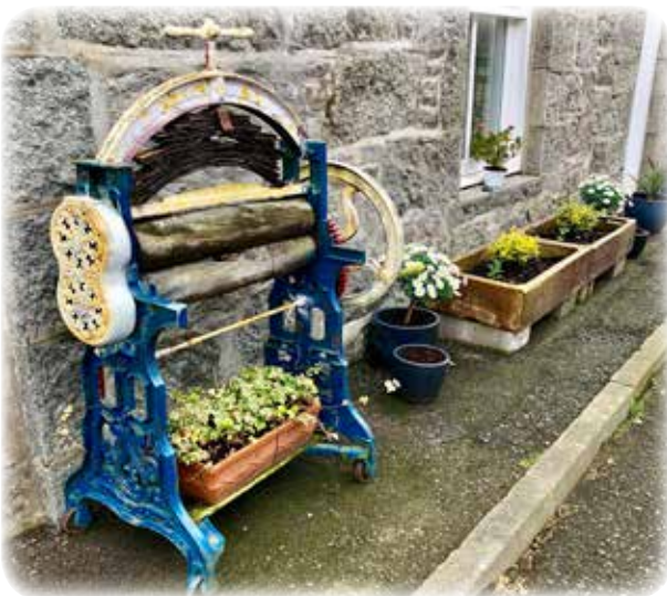
An old wringer washer in Fittie.