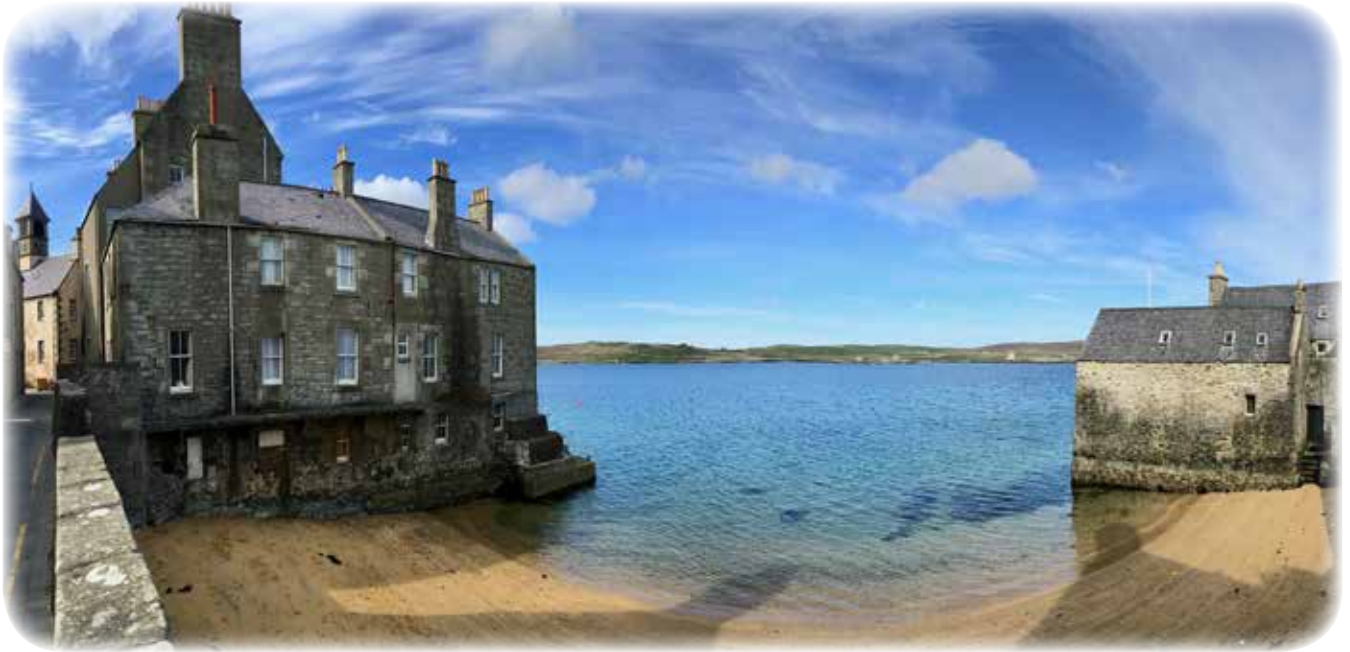
The unique and historic Queens Hotel, our home base on Shetland.