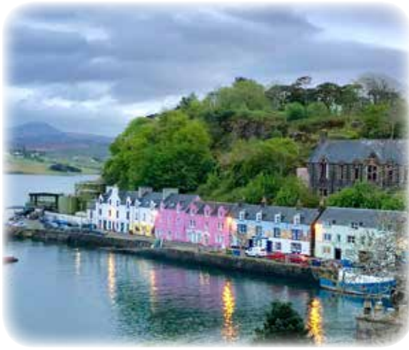
Portree evening view from our hotel.