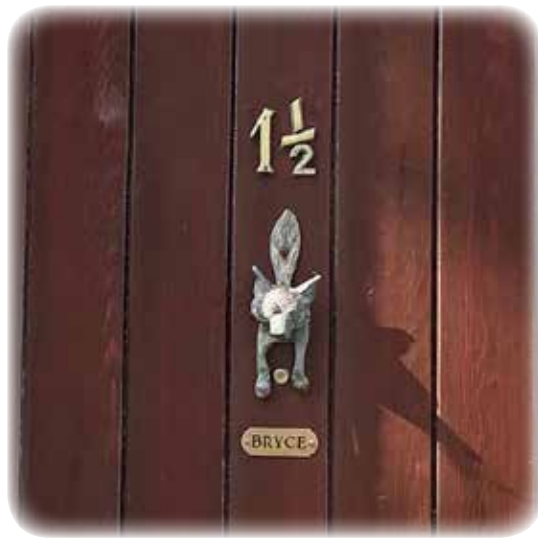
A mysterious front door.