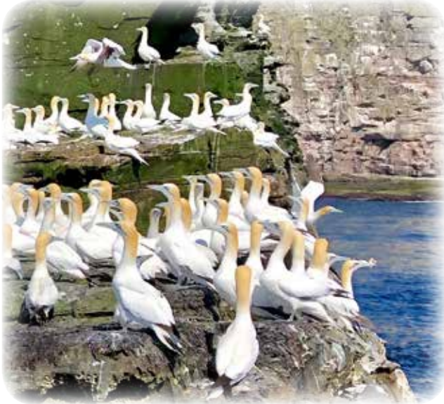
You'll see many 1,000s of gannets. They have elegant eyes and almost Art Deco features.

Our 3-hour Seabirds and Seals boat tour takes us around Bressay Island, adjacent to Lerwick, and home to vast populations of Gannets, Guillemots, Kittiwakes, Terns, Great Skuas, Cormorants, and Gulls. If the weather allows, we may be able to slowly back into a cave which has the most extraordinary colors and is filled with kittiwakes singing their name over and over again. The geology of Bressay Island is fascinating and our friends and guides can answer most of our questions.